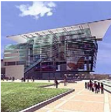
Muhammad Ali Center . Louisville . Kentucky

In order to prepare myself for college, I took my first year in a teacher's college CCSC, and then went to Pratt Institute in Brooklyn to work on a Bachelor's in Architecture. Five years later and A Fullbright Scholarship for study in the Middle East, I entered the Profession of Architecture, where I have advanced to the level of Associate Partner in the Firm of Beyer Blinder Belle, Architects and Planners LLP (I own a Limited Liability Piece of the Store) www.beyerblinderbelle.com .