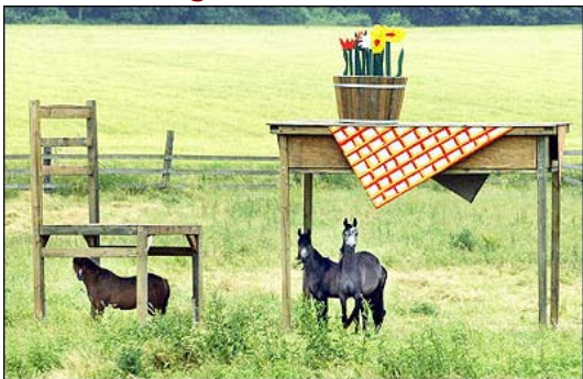
Three horses stand under an oversized table and chair in a pasture near Doellstaedt, eastern Germany.