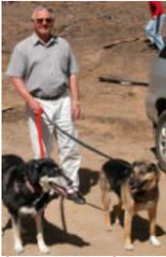
Greenwich High School.

Early on in the war, there were no facilities for laundry or bathing, etc.; no place for the troops to go to relax, watch a movie .... So, when we had troops come to our home, we showed them the showers, did their laundry, gave them a home cooked meal, let them relax watching TV or swimming in the pool, and most meaningful of all, let them use our telephone to call their loved ones in the US. Many expatriates in our communities entertained their troops, whatever their nationality.