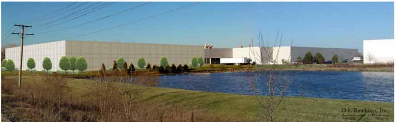
Roanoke Companies Group, Inc. Aurora, Illinois

Before and after views of Roanoke Companies Group Aurora Headquarters Founded in 1992, Roanoke Companies Group, Inc. is based in Aurora, Illinois, with additional manufacturing and distribution in Dalton, Ga. Roanoke owns and sells a number of recognized national brand names including Color Caulk®, Tile Perfect®, CHAPCO®, AIM™ and AMCO™ and licensed brands such as Scotchgard™, TrafficMaster® and Wilsonart® to leading retailers and distributors. Roanoke also is a leading manufacturer and supplier of private label flooring accessories to the OEM flooring industry.