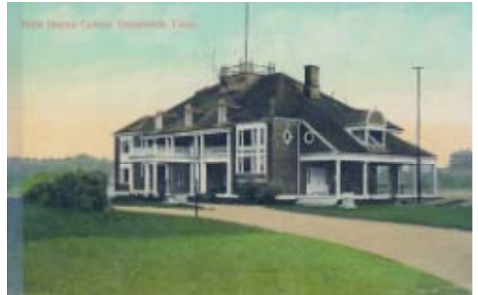
The Belle Haven Casino I wonder if it had Gaming Tables? Was it run by the Siwanoy Indians?