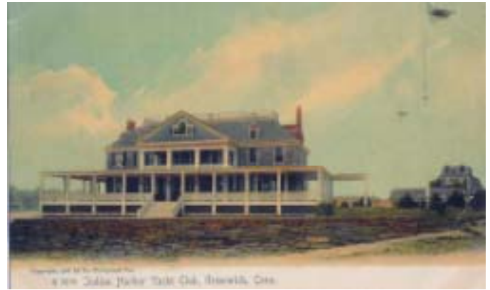
The Indian Harbor Yacht Club From the end of the Pier