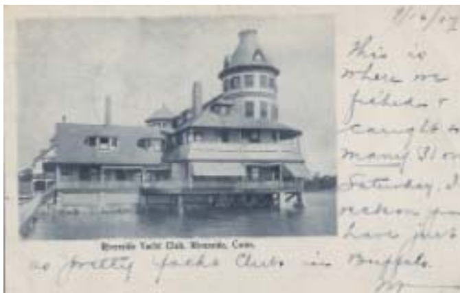
The Riverside Yacht Club I am in Love... Can I have this building, Daddy, Can I, Can I?