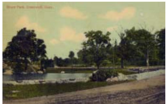
Bruce Park Parking Spots are to the right in this photograph