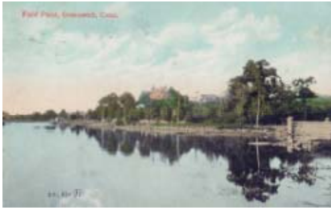
Field Point My Guess this is taken from Bruce Park Any better Guesses?