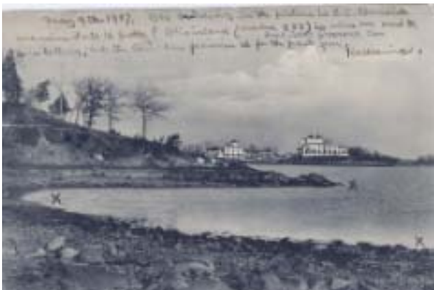
From the Shoreline of Belle Haven The E. C. Benedict Residence in the Distance