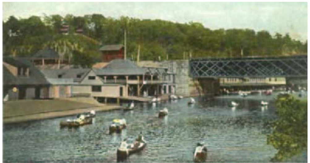
PUBLIC BOAT HOUSE, AT RIVERSIDE, SHOWING RIVERSIDE STATION AND R. R. BRIDGE.