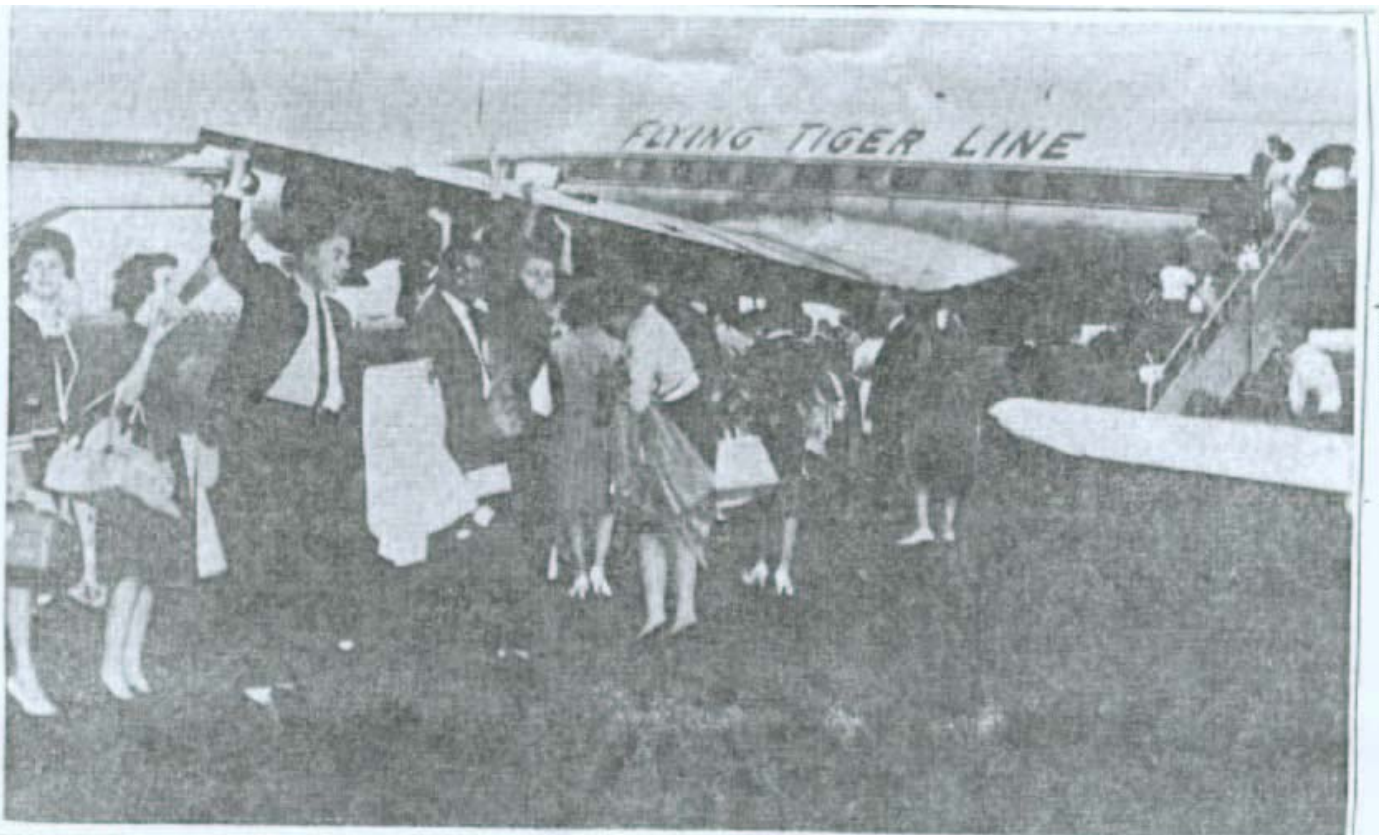
First Concert Today —Members of the Greenwich High School Senior Chorus, seen here boarding their chartered airliner at Newark Airport on Friday evening, arrived two hours ahead of schedule at Vienna on Saturday, tired and hungry, but otherwise without any serious hitch. One girl forgot her passport on the bus that