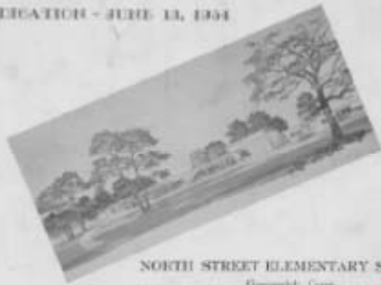
NORTH STREET ELEMENTARY SCHOOL Greenwich, Conn.