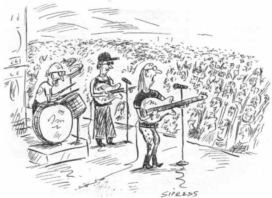
"This next one is a hard-rockin', kick-ass, take-no-prisoners tune we wrote about turning sixty."