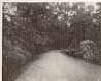
ROAD TO "THRUSHWOOD PARK"

T HIS is the combination that the country home seeker has such difficulty in finding. Taking the New Haven Railroad train at Grand Central and traveling fifty minutes by the smokeless electric service you are brought to Riverside, Connecticut, the second station beyond Greenwich. This little community is one of those most unusual places that is unmarred by tasteless houses and it has no slums. Getting off at Riverside Station and boarding a motor or a carriage, you are driven along good roads, past pleasant country homes, and as you go you get