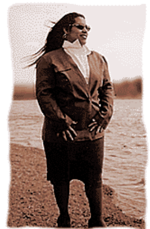
Aleshanee's Revenge: A descendant of the powerful matriarch of the Siwanoy has finally secured a just settlement for her lost tribe.